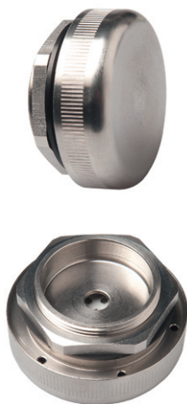
Photo: Inside view